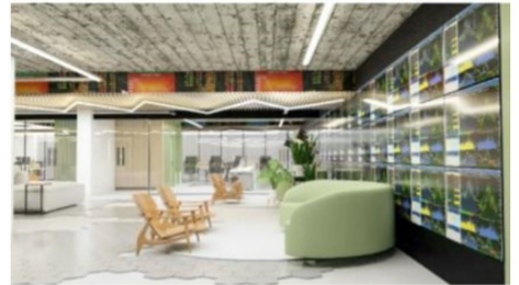
The CashFX corporate offices are in Panama City, Panama. This 10,000 sq. ft facility will allow all key CFX Corporate team members to operate in one location.